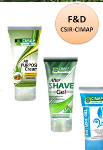
New Herbal Products of CSIR-CIMAP